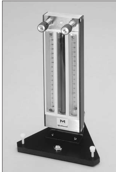
Model 7300 Series